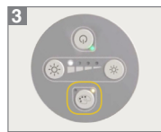
3 Set the required color.

Powerful LED's provide 60,000 Lux in this new innovative exam light. The Gamma 60 LED is maintenance free and suitable for any type of exam room. The light comes with four dimming levels, two color shades, an antimicrobial finish and a 360° rotary lighthead. The Gamma 60 LED can be ceiling mounted, rail mounted or on a roll stand to meet all your room requirements.