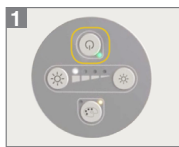
1 Switch on the light at lighthead.