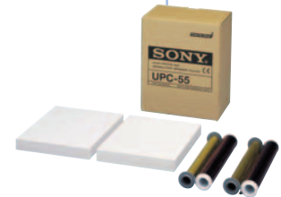
UPC-55 Media Print Pack