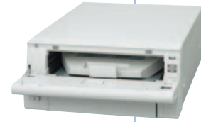
UP-55MD Media Tray

** Sony Media Solutions Company offers many other USB MicroVault choices.