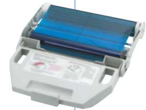
UP-55MD Media Tray