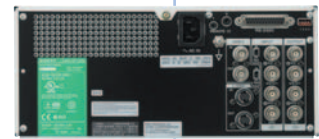
UP-55MD Back Panel